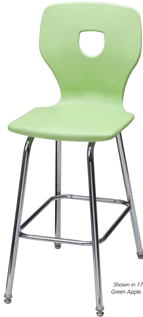
Shown in 17"D, 15.5"W, x 27"H Green Apple Seat, Chrome frame