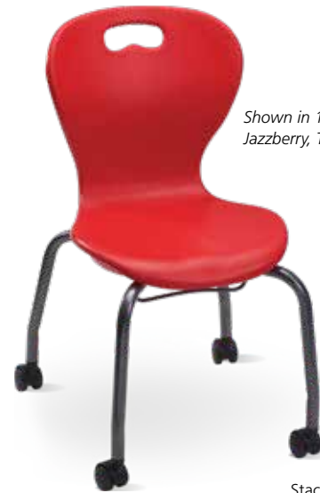
Shown in 16.5"D, 16"W, 18"H Jazzberry, Titanium frame