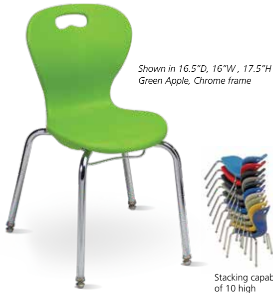
Shown in 16.5"D, 16"W, 17.5"H Green Apple, Chrome frame